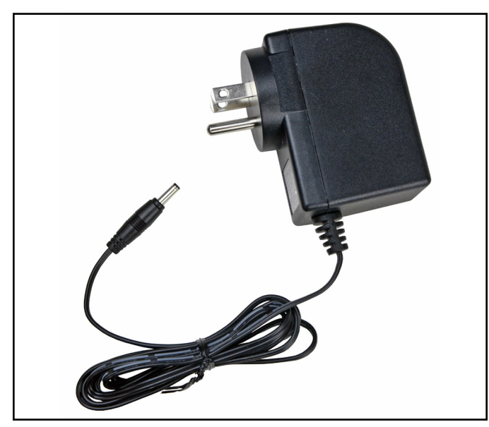
Figure 2. North American power adapter included with the 19239 and 19242 Mini Monitors