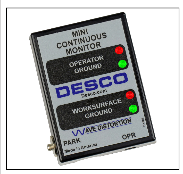
Figure 1. Desco Mini Monitor