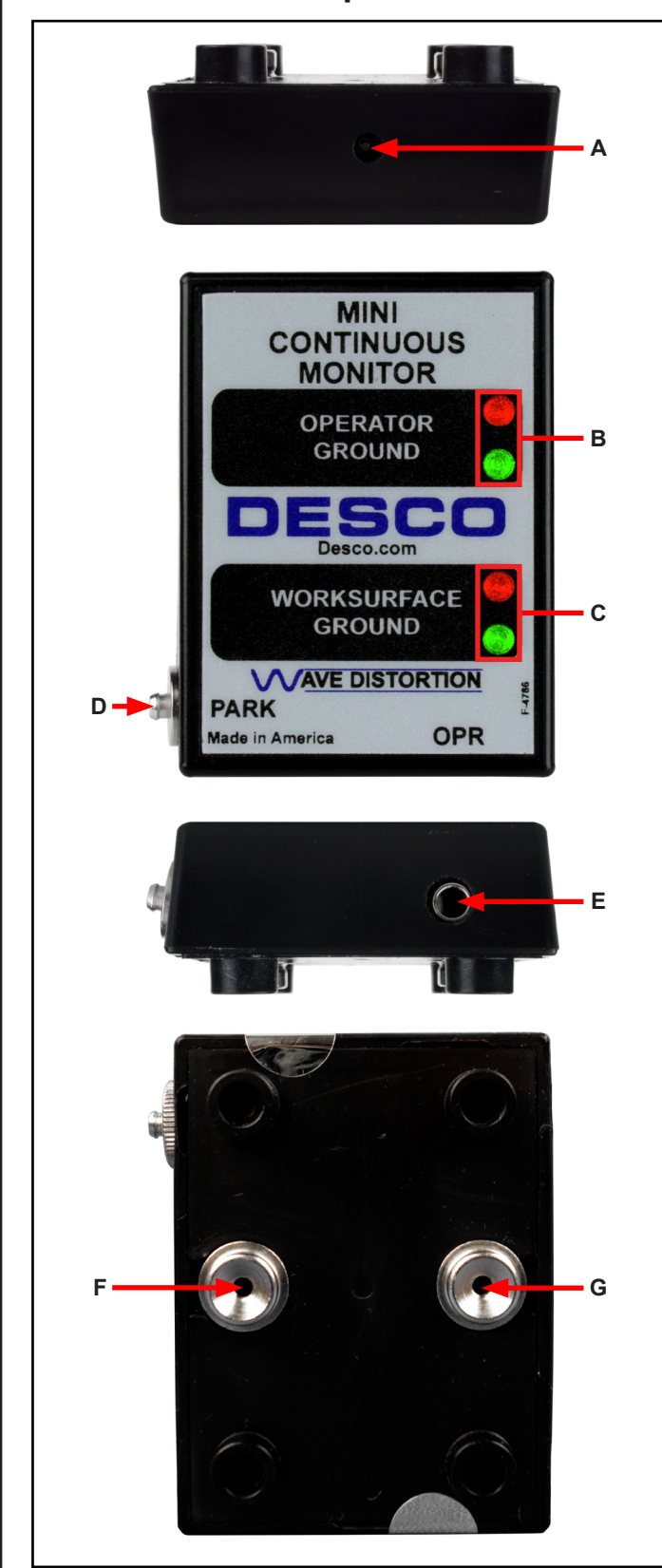
Figure 4. Mini Monitor features and components