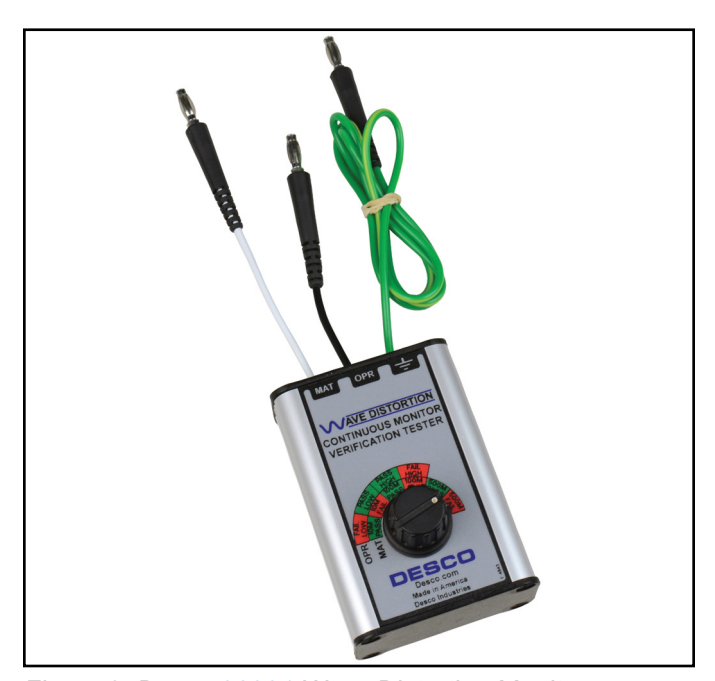
Figure 9. Desco <u>98221</u> Wave Distortion Monitor Verification Tester

See <u>TB-3074</u> for more information.