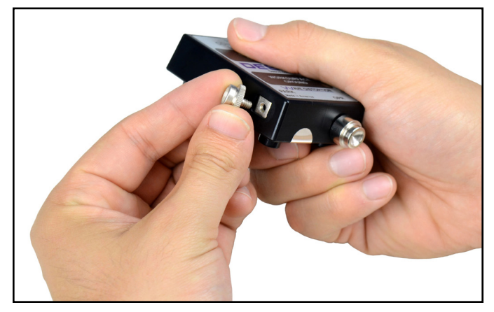
Figure 7. Changing the park snap on the <u>19243</u> Mini Monitor

The 19243 Mini Monitor includes an interchangeable 10mm park snap and 10mm banana jack adapter for operators who use wrist cords with 10mm terminations. Use the park snaps' knurled rims to unscrew the 4mm park snap from the monitor and install the 10mm park snap to the monitor. Plug the 10mm operator jack adapter into the monitor's operator jack.