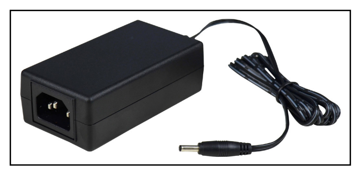
Figure 3. Universal power adapter included with the 19243 Mini Monitor

NOTE: The power cord must be purchased separately if ordering the 19243 Mini Monitor. The power cords are available as the following item numbers: